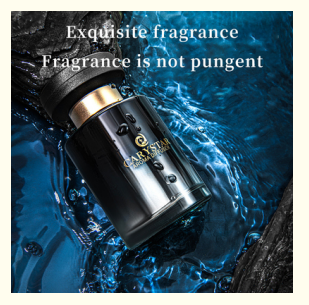
Refreshing from fragrance