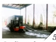
Loading and transporting