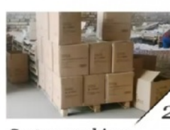
Carton packing with pallet