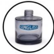
Slik Screen Printing