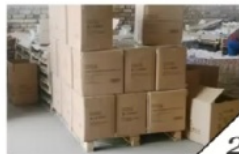
Carton packing with pallet