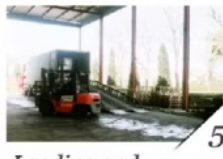
Loading and transporting