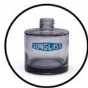
Slik Screen Printing